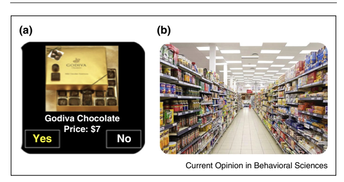
(a) Typical laboratory consumer choice paradigm and (b) typical consumer choice scenario. (a) Adapted from [4<sup>*</sup>].

this effort has been the application of functional neuroimaging techniques to a simple yet powerful framework where people make decisions by evaluating and maximizing subjective value associated with competing alternative [12–14]. However, it remains challenging for this knowledge to provide a mechanistic account of even relatively simple acts such as purchasing a breakfast cereal.